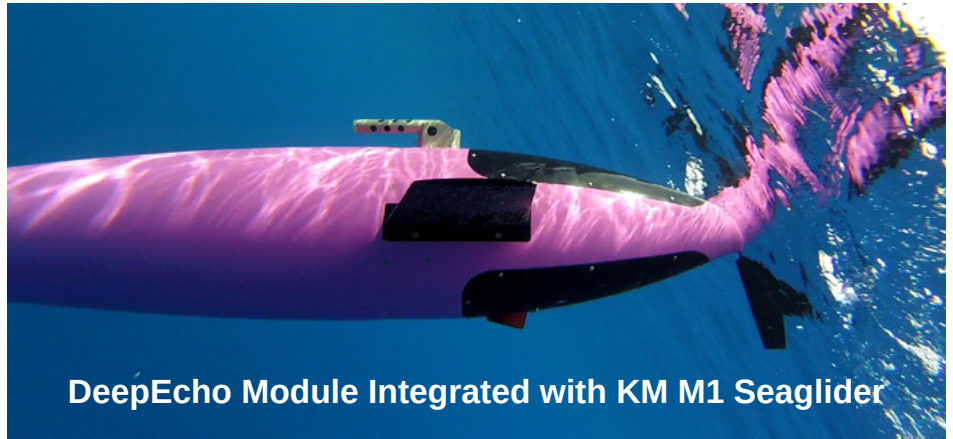
DeepEcho Module Integrated with KM M1 Seaglider

The echosounder operates on descent with the transducer facing vertically downwards.